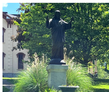
Above far left: Mary in Assumption Court stands amid the flowers placed by children. Above center and above: Mary is crowned in front of Maria Hall and in the chapel. Far left and left: The patron of our home hears our prayers for so many intentions.