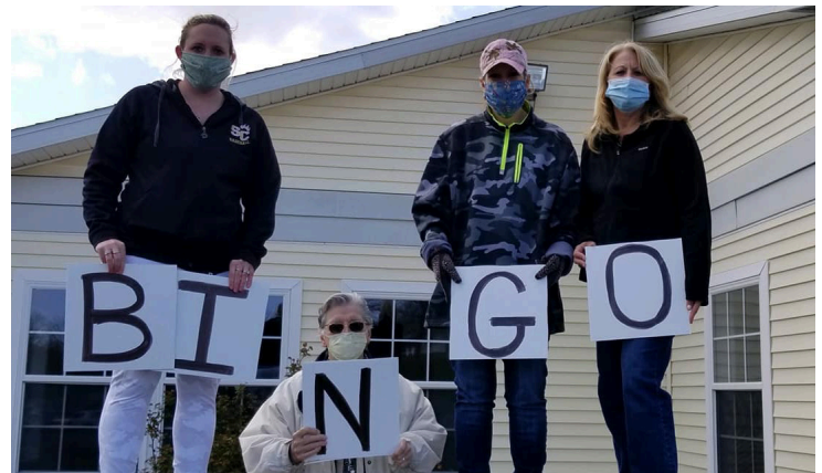
Above and right: Projecting to a parking lot filled with Bingo card holders, numbers reach the players by visual and audio means.